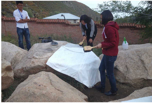
Figure 3. Stamping the paper mâché into place with stiff brushes.

It needs to be emphasised that all participants of the recording program earnestly believed in seeing the petroglyphs and that they still perceived petroglyph grooves even after their non-existence had been pointed out. Indeed, they were incredulous that the three specialists could not see them, and there was absolutely no collusion among the recorders to mislead deliberately. However, what is most astonishing is that not only did they ‘see’ the petroglyphs, but they also experienced similar, if not identical, designs. Yet the continuing investigation of the rock art specialists on the following days showed that of the several thousand petroglyphs recorded on the hundreds of blocks in the salvage yard, not even one existed. However, because of the intensive search and strenuous endeavour to detect the rock art others saw, after three days, the author began experiencing the sensation of seeing petroglyph grooves where blocks had been traced in black pigment when observing them from about two metres distance, but when he examined the effect closely the grooves ‘disappeared’.