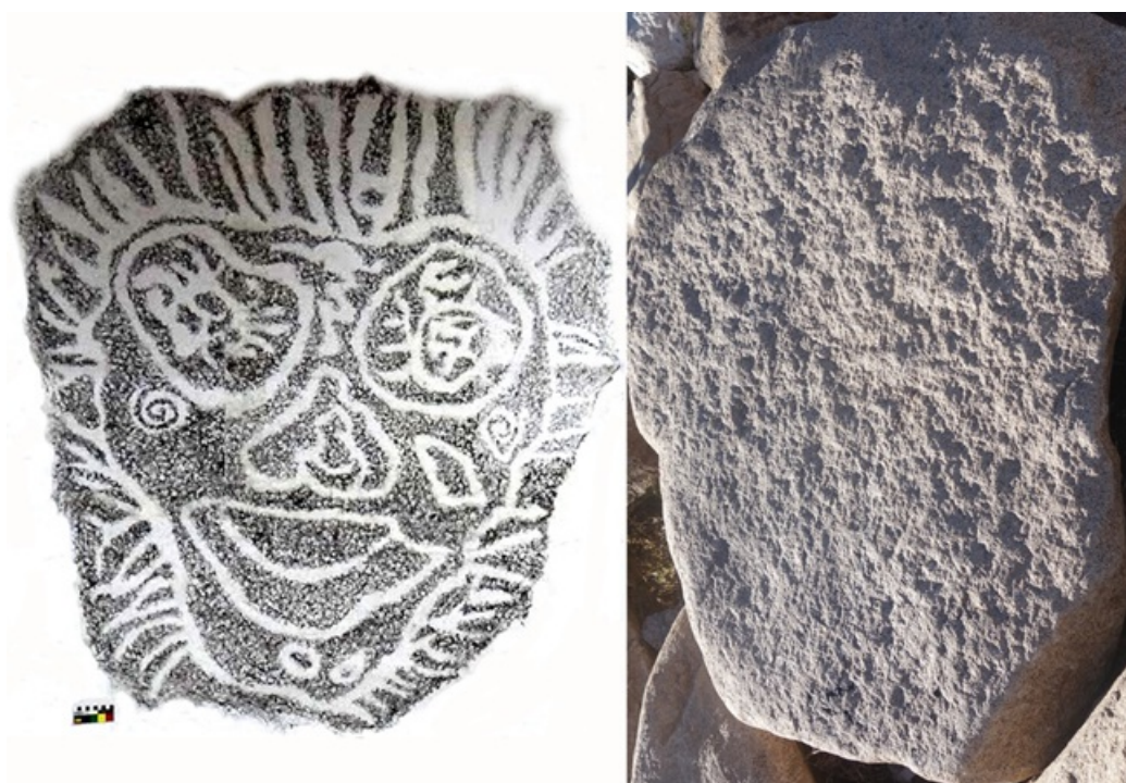
Figure 2. Recording taken from one boulder in the Xiaojinggou salvage yard, and view of the same panel in identical orientation.

Therefore, the specialists requested that the recording procedure be demonstrated. Two members of the recording team obliged, placing thick paper over a rock, spraying it lightly with water, covering it with a thick cloth and stamping the paper mâché into position with stiff brushes (Fig. 3). The cloth was then removed and the paper allowed to dry for an hour. Rather than by rubbing, the black pigment was then applied by stamping with small brushes, each of the two operators commencing from a different part of the panel. This is obviously much gentler than rubbing, and the objective was to emphasise rises in the surface and avoid depressions, as would be the case in rubbing. After several minutes, the recorders were asked to pause, and the specialists examined their work closely. There was no correspondence between depressions on the rock and blank areas in the pigment; the pigment had been applied independent of the surface topography. Amazingly, it had begun to outline blank areas, forming grooves that allowed a single design to emerge. All this had taken place without verbal communication between the two operators, who had commenced in unison to produce one of the stylised face arrangements. Other recorders were then asked to show the process of highlighting supposed petroglyphs with black paint, and again, it was entirely clear that their lines were not following any real grooves or depressions on the rock.