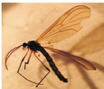
Figure 5. Hesperinus imbecillus (Loew, 1858) male, habitus

Mycetophilidae. The head capsule is heavily sclerotized, almost black. The following features are characteristic of the Hesperinus imago: 12-segmented antennae are long, significantly exceeding the length of the head and thorax. The male's eyes are circular, separated by a wide front. They are simple, that is, they consist of uniform facets. The legs are thin and common. The subtype is poorly represented in recent fauna and only one representative of the family Hesperinidae ( Hesperinus ) is a residue of this once-abundant subtype. Specialization is an interesting relic: Females don't have wings (Figure 5) [9-10].