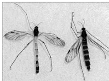
Figure 8. Male (left) and female (right) of Pachyneura fasciata Zetterstedt, 1838.