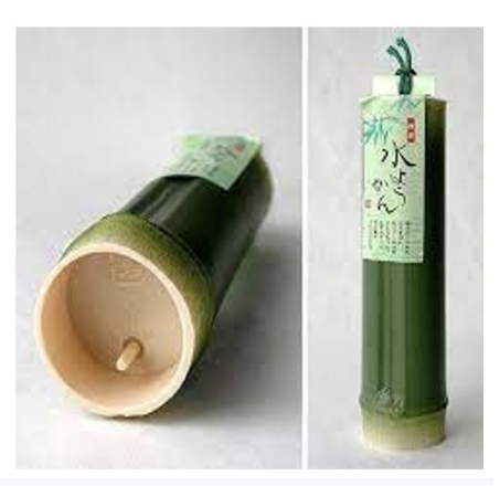
Figure 1. Traditional packaging

Until now, modern packaging made from various materials has been widely used. However, in an effort to revive the traditional image of food, artisans have started to explore traditional ingredients for packaging purposes. Traditional packaging typically utilizes natural materials such as leaves, bamboo, wood, rattan, and fibers. By incorporating an attractive packaging design, it can significantly increase the perceived value of the product, ultimately leading to higher sales. Despite being slightly more expensive than conventional packaging, products sold in traditional-patterned packaging enjoy high demand, particularly among souvenir entrepreneurs who value its uniqueness. A well-designed traditional packaging should possess a unique, fashionable, and trendy design while still serving its functional purpose. In this context, the role of designers is crucial as they need to creatively redesign traditional packaging while preserving local and unique cultural identities. Consequently, consumers are not only interested in purchasing traditional food for its contents but also for its distinctive packaging appeal. An innovative design approach can create a desire among buyers to collect such products.