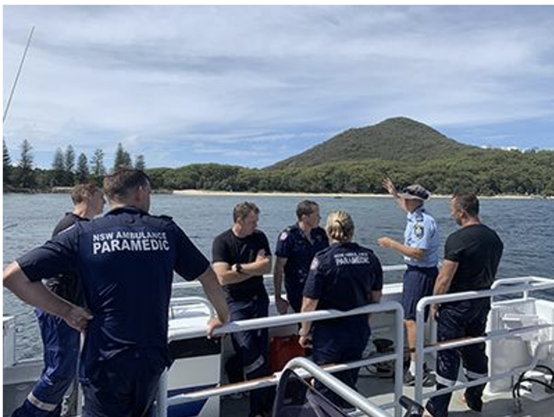
Picture 1. Paramedics training with NSW Police — Port Stephens Marine Area Command [15]