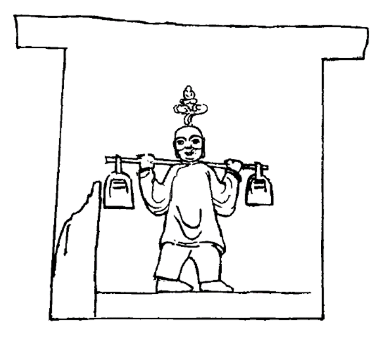
图8 第8 龛造像