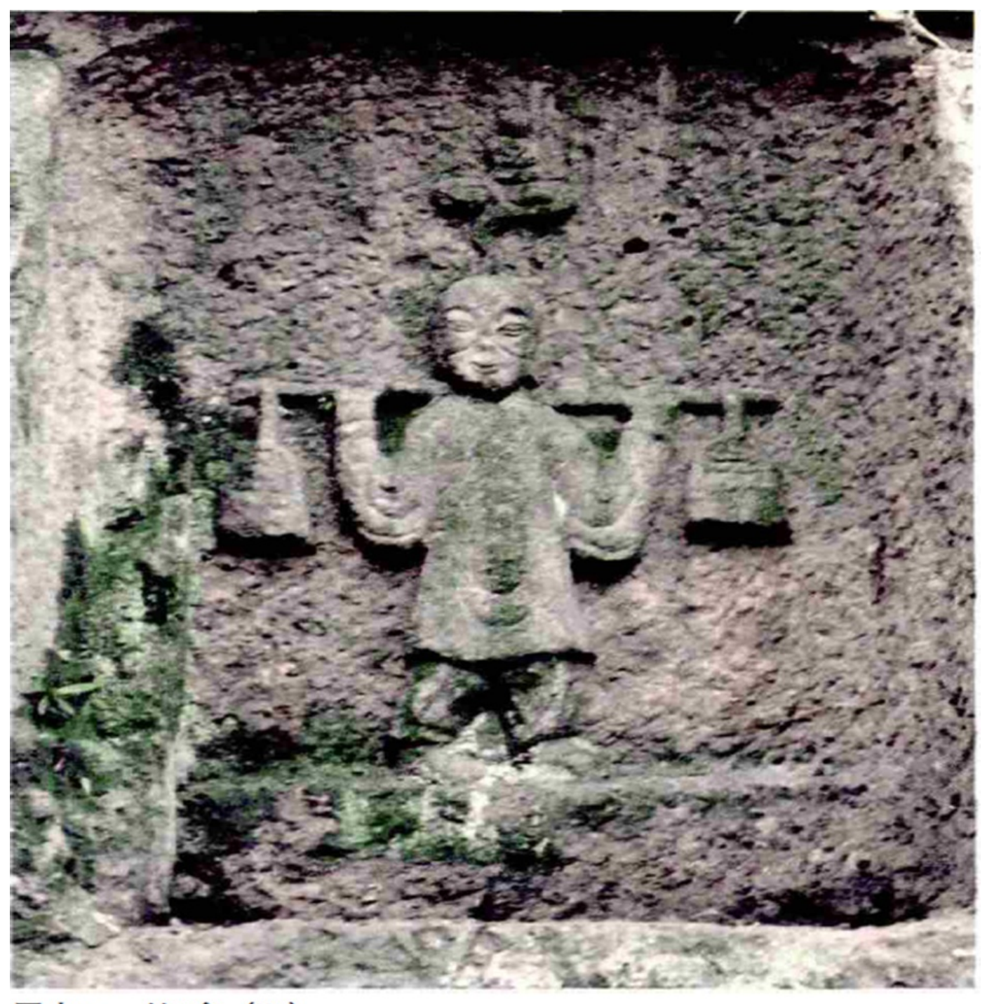
图十一 第8龛 (K8)