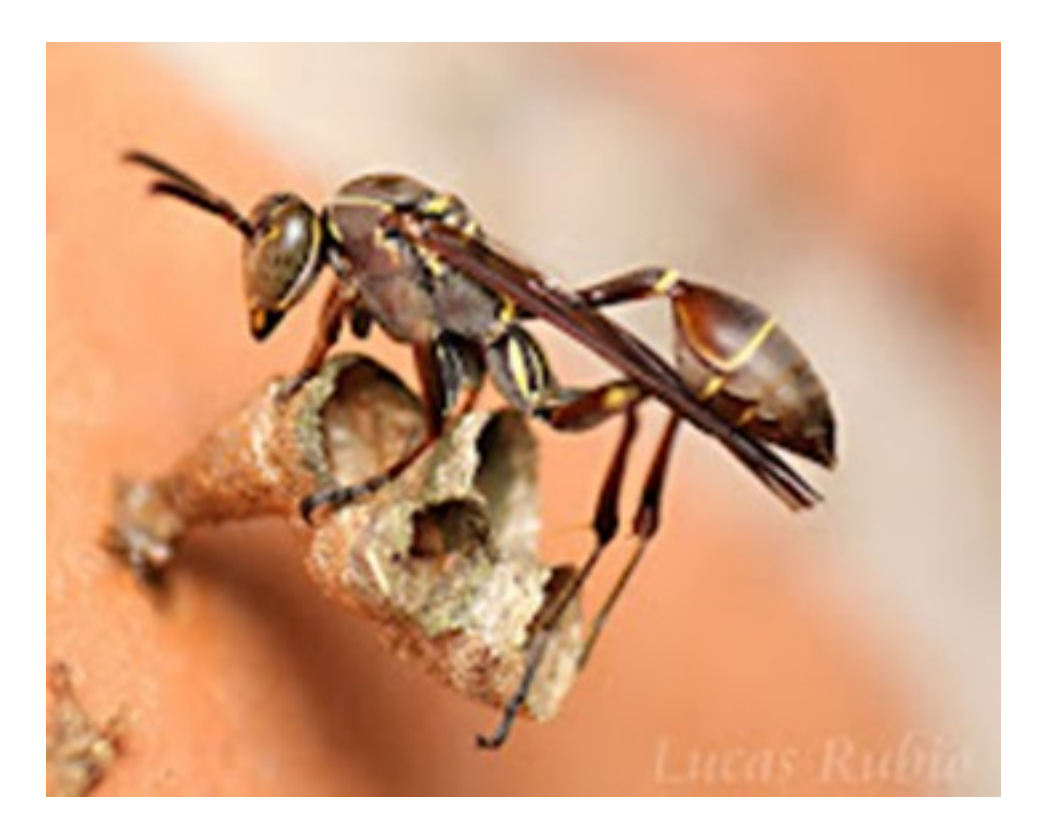
Figure 6. Wasp cartonera Mischocyttarus drewseni Saussure, 1857.