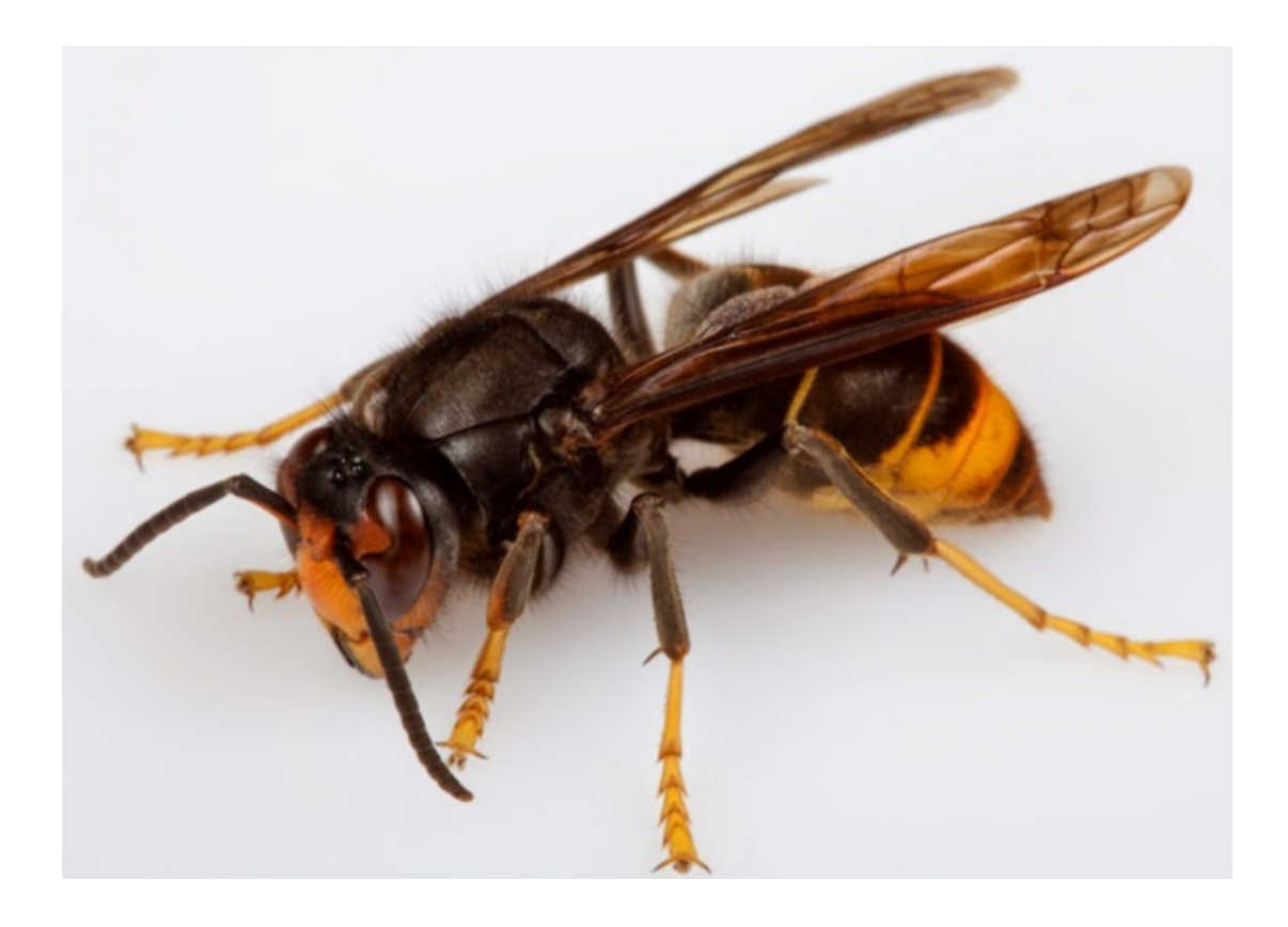
Figure 4. Asian wasp Vespa velutina Lepeletier 1836.