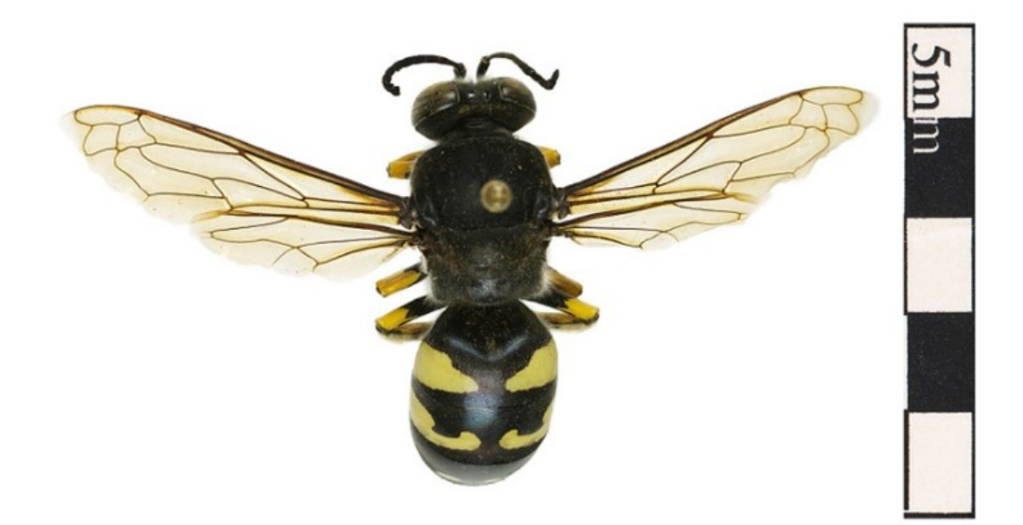
Figura 1. Vespa Cavalo Guarda - Stictia carolina (Fabricius 1793).

The horse marimbondo or hunter marimbondo has different names and can be known, depending on the region of Brazil, even as a dog horse, a wasp hunter, and a spider hunter. The horse wasp has two characteristics that make it quite feared: it is considered by many to be the insect with the most painful sting in the world. The other is that it hunts spiders so that they become hosts and, later, food for their larvae. This type of wasp is, on average, 5 centimeters long, but some individuals can reach 11 centimeters. (Figure 1) [1-7].