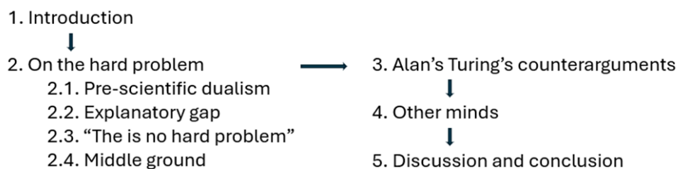
Figure 2. The article structure