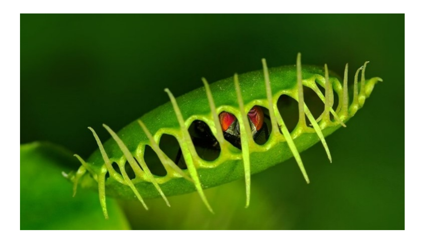
Figure 1. Carnivorous plants with their prey (fly) inside.

To understand carnivorous plants, it is necessary, first, to understand the habitat in which they are located. They tend to develop in environments with nutrient-poor, waterlogged, and mostly acidic soil. These adverse and scarce conditions require different strategies and traps for their nutrition. Also called insectivorous, this species captures prey to use as a nutritional supplement. It can be observed that different species adapt to the natural environment extremely easily. They transform according to the needs that survival in each territory requires. The carnivorous plant is the result of this process. The presence of a digestive enzyme allows the carnivorous plant to feed differently from other plants (Figure 1) [1-3].