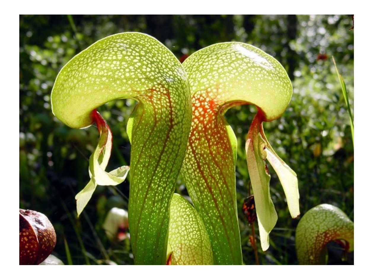
Figure 6. Darlingtonia californica Torr. (Sarraceniaceae).

Known as the snake plant, D. californica also belongs to the group of carnivorous plants. The ingenious plant captures the insects through the hole through which they enter and is then enveloped in a viscous, immobilizing secretion. This secretion in turn contains microorganisms and enzymes that degrade insects by digesting them (Figure 6) [13-14].