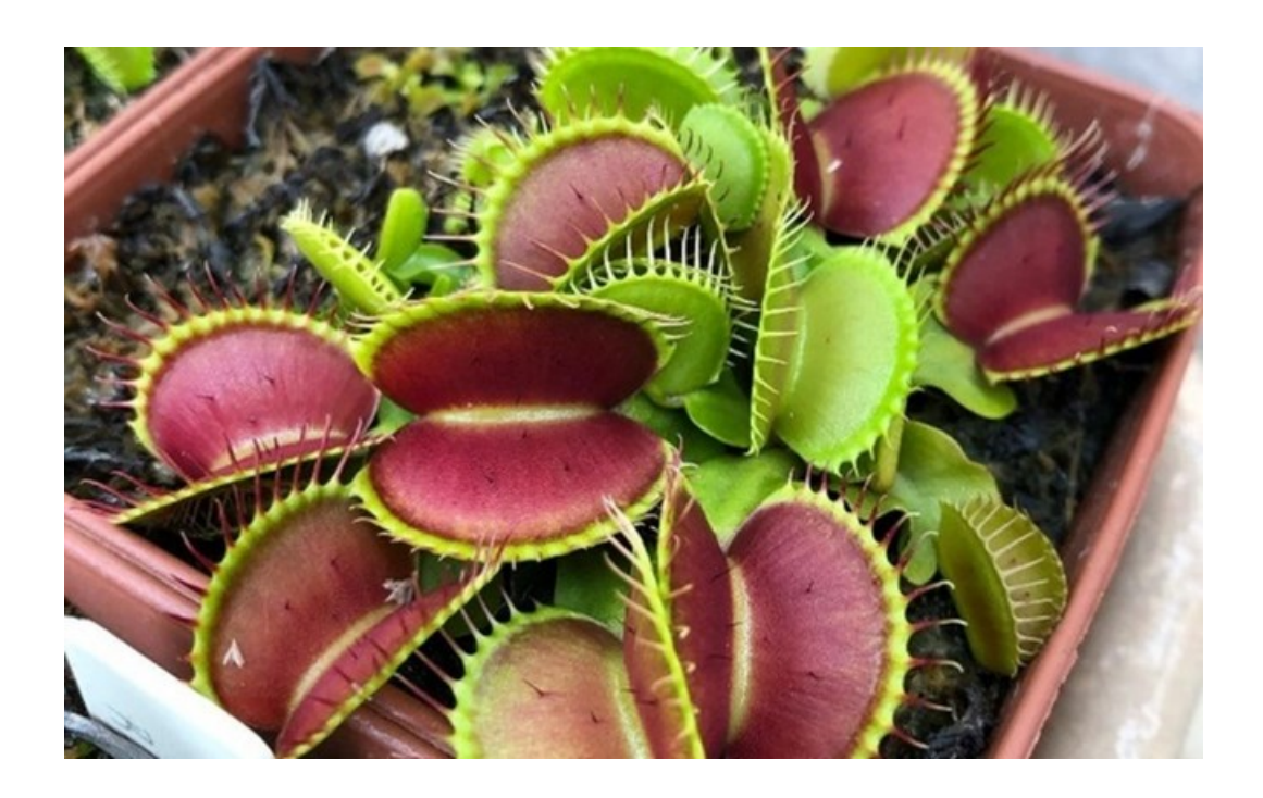
Figure 12. Dionaea muscipula Werewolf (Droseraceae).

Nephentes rajah Hook.fil. (Nepenthaceae) largest known carvioria plant.