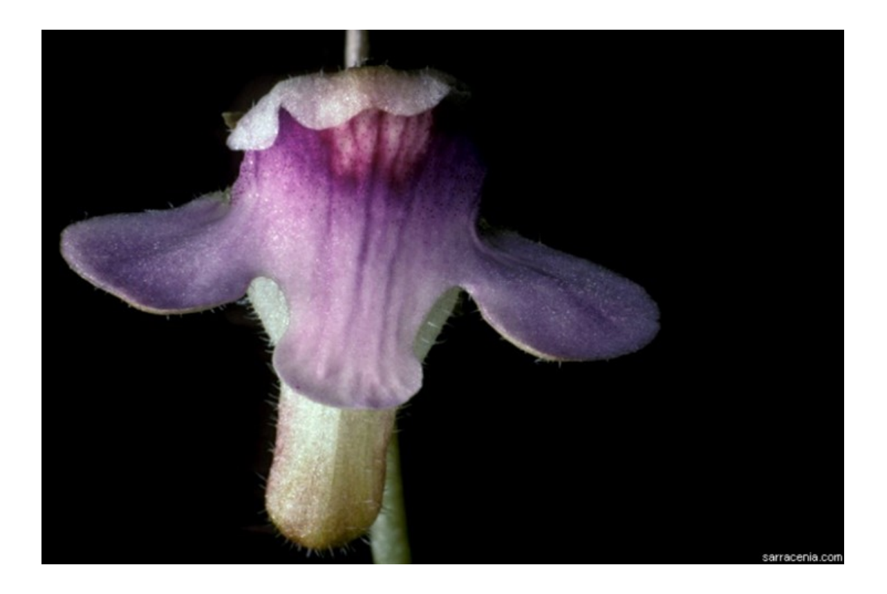
Figure 11. Genlisea hispidula Stapf (Lentibulariaceae).

Dionaea muscipula Werewolf (Droseraceae).