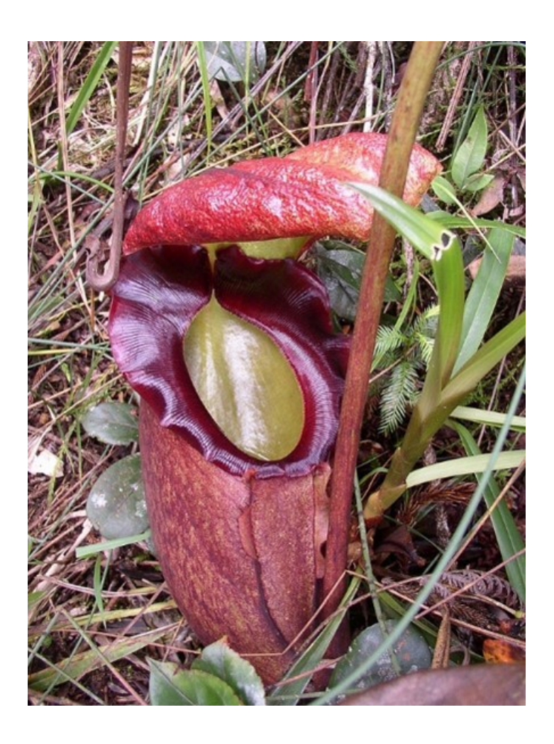
Figure 3. Nephentes rajah Hook.fil. (Nepentáceas). It is a species endemic to Mount Kinabalu and Mount Tambuyukon in Sabah, Borneo. N. Rajah grows exclusively on serpentine substrates, particularly in infiltration areas, where the soil is loose and permanently moist.

mechanical stimuli to capture prey and subsequent digestion. The most famous representative of this group is Dionaea sp. Carnivorous plants are very easy to grow and seedlings must be purchased from authorized producers. They don't require much care other than irrigation. They are very demanding when it comes to humidity, both in the substrate and in the environment (Figure 3) [6-8].