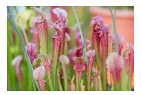
Figure 9. Sarracenia L. (Sarraceniaceae).

appears in spring, exuding an odor that attracts pollinating insects (Figure 9) [14-20].