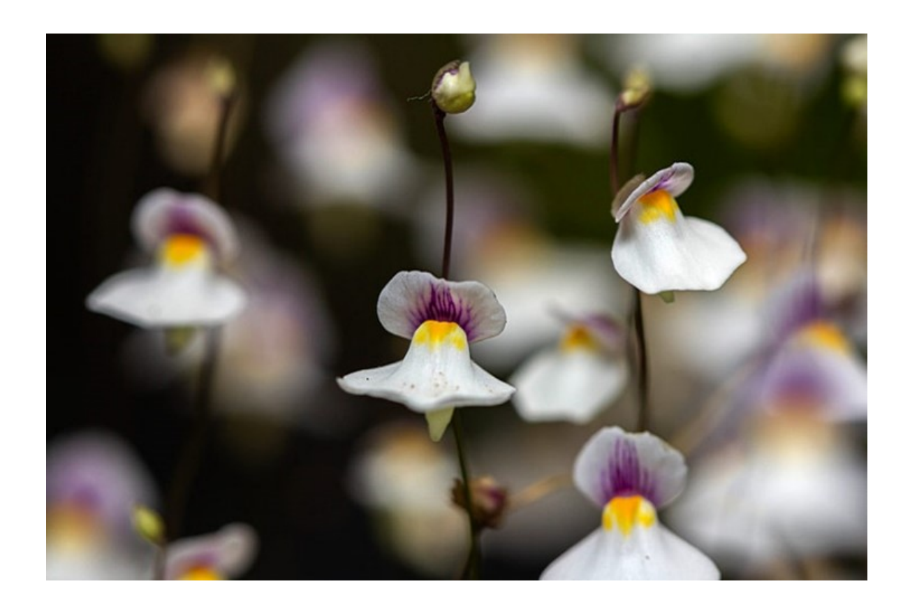
Figure 8. Utricularia L. (Lentibulariaceae).

These carnivorous plants don't look like carnivorous plants. Utricularia looks like a flower and many see similarities between species of this carnivorous plant and orchids. Aquatic, utricularias are small and bottle-shaped. They hibernate during the winter to resist the cold and use suction to capture prey when they are active (Figure 8) [14-20].