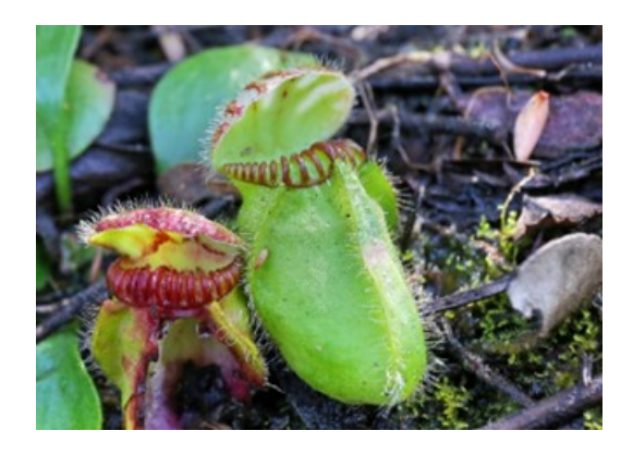
Figure 10 . Cephalotus follicularis Labill. (Cephalotaceae).

Native to a region in southwestern Australia, where it grows in coastal and constantly flooded areas. Your trap, which is nothing more than modified leaves. It can be grown in indirect sunlight, so the plants will grow larger, but with greenish pitchers; In direct sunlight, the pitchers become smaller but obtain a beautiful reddish color; Keep the moisture content high in an attempt to keep the liquid in); Do not leave the pots in dishes filled with water, as the roots may rot; Its growth is slow and must be planted in large pots, as the rhizomes will grow, making it possible to propagate by division (Figure 10) [14-20].