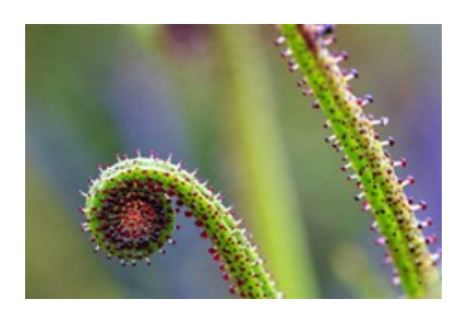
Figure 7. Drosophyllum lusitanicum (L.) Link (1806) (Drosophyllaceae). https://www.floresefolhagens.com.br/drosophyllum-plantas-carnivoras/.