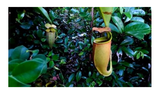
Figure 5. Nepenthes bicalcarata Hoo.f. (Nepenthaceae).

Darlingtonia californica Torr. (Sarraceniaceae).