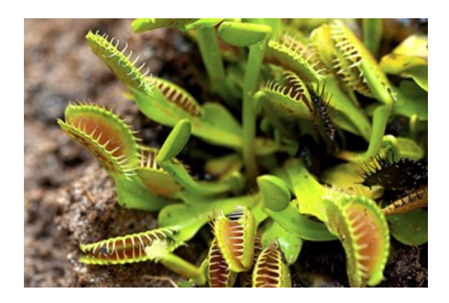
Figure 4. Each leaf of a Venus flytrap is a trap: Dionaea muscipula Werewolf (Droseraceae).

Known as a "T" type trap that it uses to capture its prey, it mainly attacks small insects, such as mosquitoes and flies. It is one of the best-known carnivorous plants in the world, but it is native to the swampy regions of the southeastern United States. Small in stature, this species is between 10 and 15 cm tall and its leaves have a shape that characterizes its trap, mainly due to the presence of the thorns it has. This species produces nectar that attracts insects and, when touching the leaves, the prey is perceived in the sensory hairs. The trap closes quickly, forming a kind of cage for the animal (Figure 4 ) [10-11].