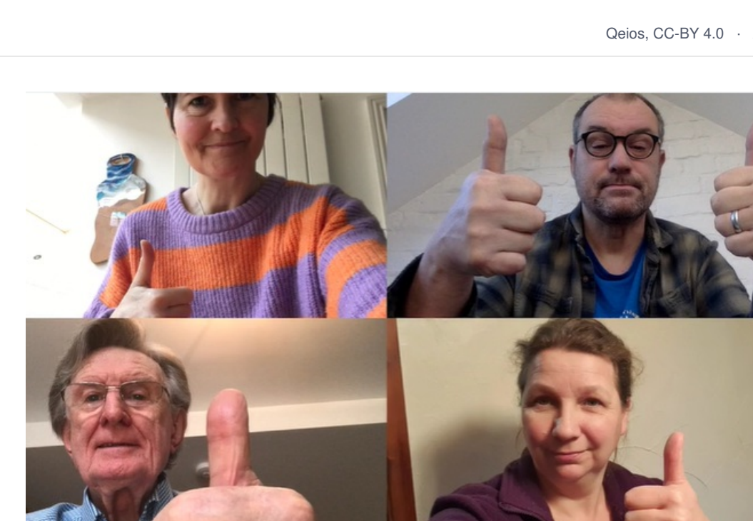
Figures 2 and 3. Patient experience of VC through photos.

"Not having to travel to the hospital and waiting in the waiting room was so much better, and there was no stress trying to get around everything all of the time" (Patient, CVUHB, 45-64)