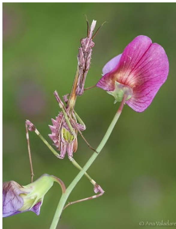
Figure 1. Empusa pennata (Thunberg, 1815) (nymph). Sources: Algarve/ 22.04.2018

Mantodea are insects popularly called praying mantis. The scientific name of this order, Mantodea, originates from the combination of the Greek words “μάντις = praying mantis” which means prophet, seer, and diviner. Furthermore, the suffix “εἶδος = eidos” which means form, type and similar. This alludes to the position these insects adopt when at rest, with their front legs folded under their body, like the posture of a person praying (Figure 1) [1-12].