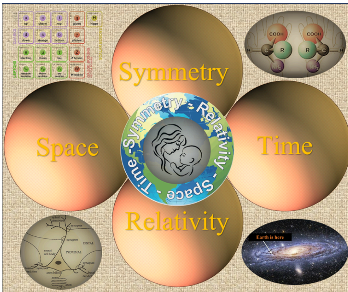
Fig. 1. (GA Legend). Allegorical/metaphorical representation of four fundamental determinants (driving forces) of biological evolution. Space, time, symmetry, and relativity are considered as the elements of tetrahedral meta-structure (adopted from [3] with alteration).