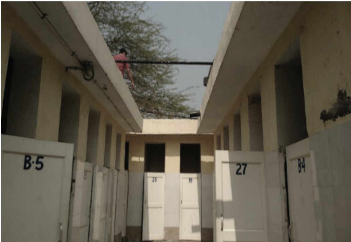
Image 6. Existing CTC in Kusumpur Pahari